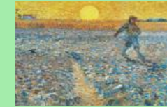
The Parable of the Sower

Wistanstow School – Growing and Learning Together