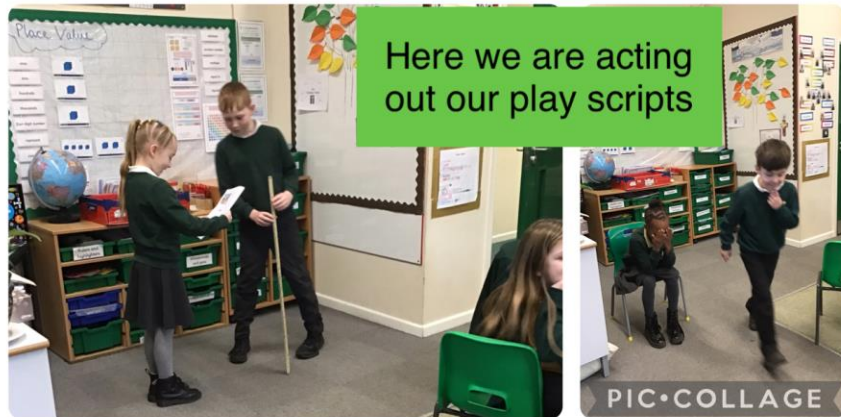
Here we are acting out our play scripts