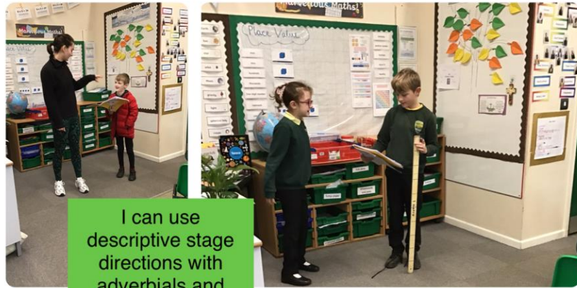
I can use descriptive stage directions with adverbials and prepositional phrases