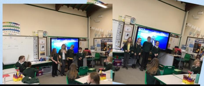
We composed music using our mouths to represent 'The Haven'.